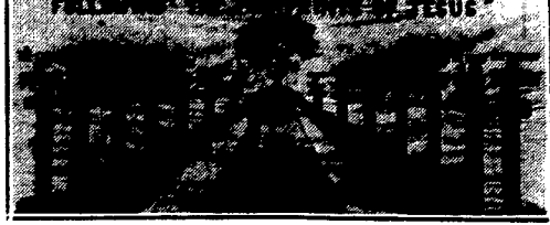
CHURCH OF CHRIST, Wayne, Nebraska